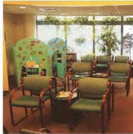
Emergency Department Plants & Playhouse