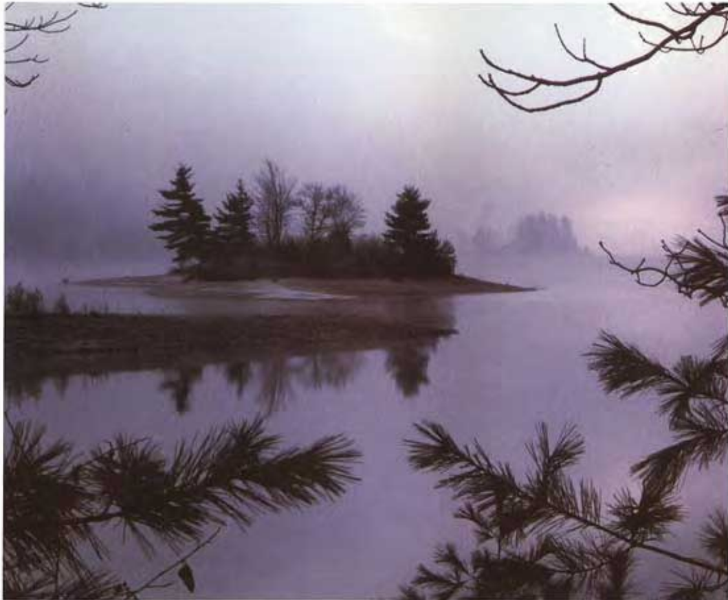
Patrick Zephyr, Wendell, MA

"The art exhibit is a wonderful idea, lots of interesting works to engage our minds in something other than medical tests!"