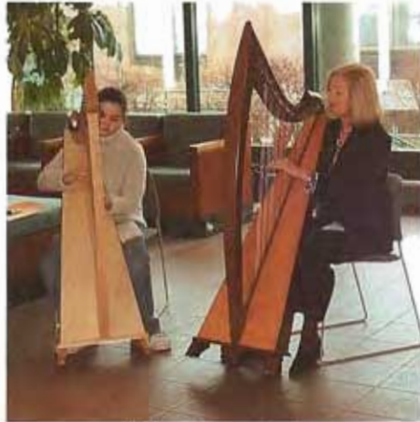
Lobby Concert Series

"It's a nice addition for the community to have these musical events."