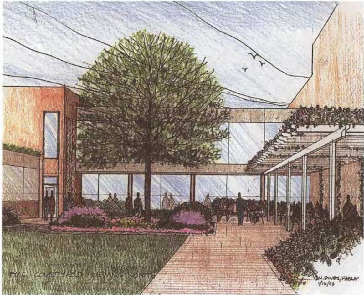
Architect's Rendition of Franklin Medical Center Courtyard Renovation